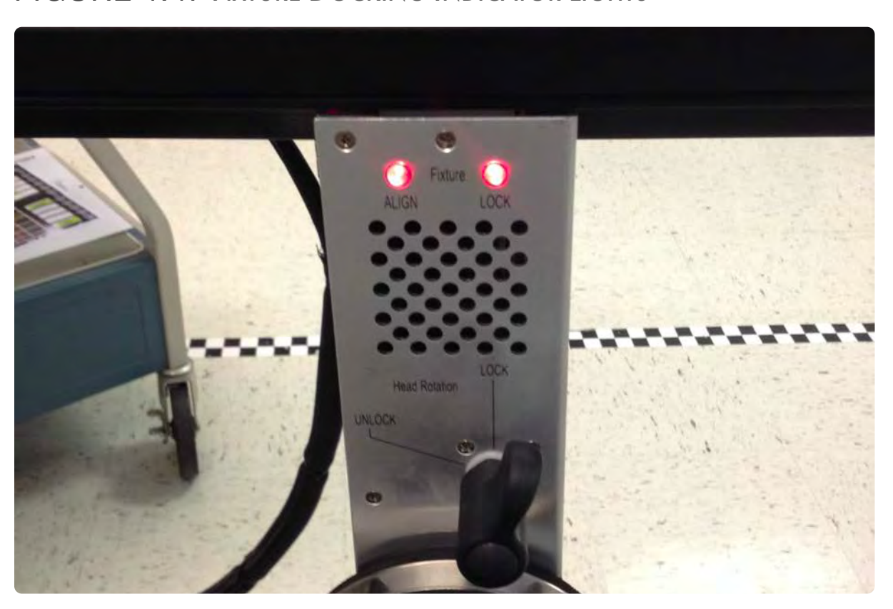
FIGURE 1.47 FIXTURE DOCKING INDICATOR LIGHTS

The docking indicator lights are located on the side of the test head nearest the infrastructure chassis. When the test head is powered up and active but no fixture or calibration/diagnostic plate is present both LEDs are red.